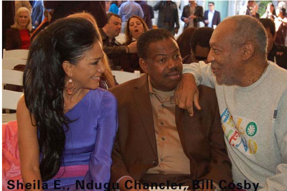
Sheila E., Ndugu Chancler, Bill Cosby

We interrupt your regularly scheduled program to bring you an important announcement. The lineup for the 34th Annual Playboy Jazz Festival in co-operation with the L.A. Philharmonic Association, was announced at a Press Conference on the grounds of the Playboy Mansion, February 16th, 2012. The eagerly anticipated announcement is welcome news for music aficionados who attend the festival each year. An added treat is the announcement that the festival will return to the popular Father's Day Weekend, June 16 & 17, 2012.