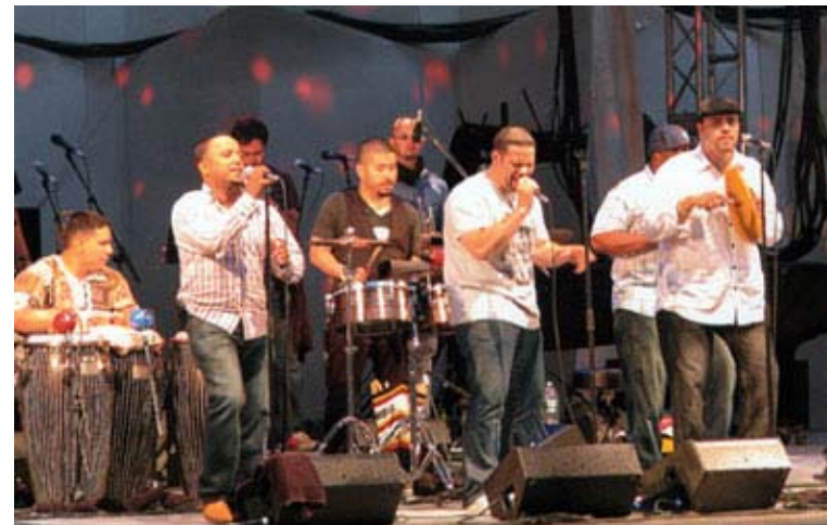
(Pictured above: La Excelencia)

While the salsa and Latin jazz music scene worldwide is at a lull, in Los Angeles a new salsa band or Latin jazz group seems to sprout just about every week. With literally dozens of bands competing daily for a few local gigs, the competition is stiff and promotions are very important for the survival of live music. The popularity of salsa keeps the salsa dance clubs open and the bands working alongside the DJs. Latin jazz groups are limited to performances in festivals