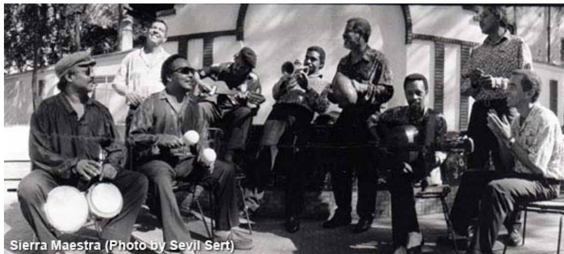
Sierra Maestra

As summer comes to an end, the industry continues to pump re-issues into the Latin market and many new recordings are mostly available worldwide through the Internet, as brick-and-mortar stores become a thing of the past.