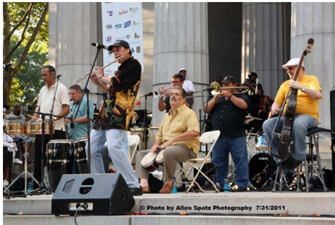
On July 31, 2011, Grants Tomb was the scene where The National Jazz Museum of Harlem All Stars performed as part of Harlem Week. I'm sure that many of you will recognize some if not all