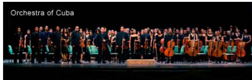
Orchestra of Cuba